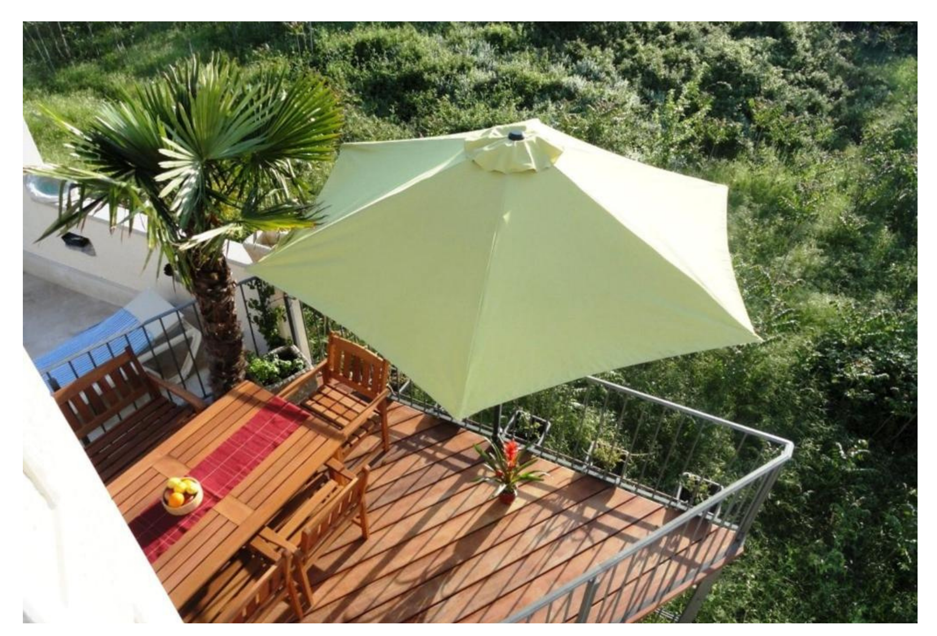
Enjoy al fresco dining on the sun-kissed terrace surrounded by nature and palm trees

Villa Serena presents an excellent opportunity for both personal enjoyment and rental income. Thanks to its size, amenities, and proximity to the beach, it appeals to travelers seeking authentic island experiences in a peaceful environment. The villa comfortably accommodates up to 10 guests, making it a highly desirable option for family vacations or group stays. In peak season, the property has strong rental potential, with demand for secluded yet well-connected homes on Brač continuing to grow. Whether used as a holiday home or as an income-generating rental property, Villa Serena offers strong lifestyle and investment value.