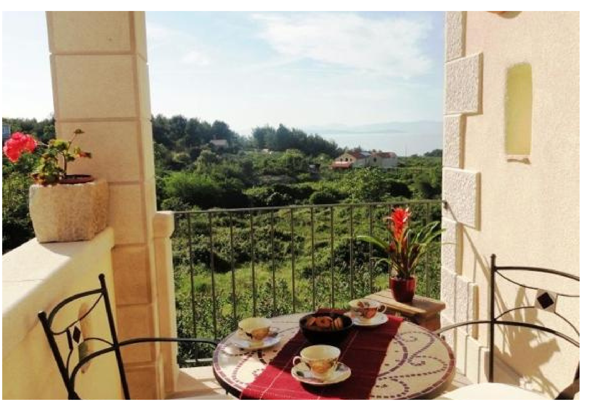
Day or night, romance is always there