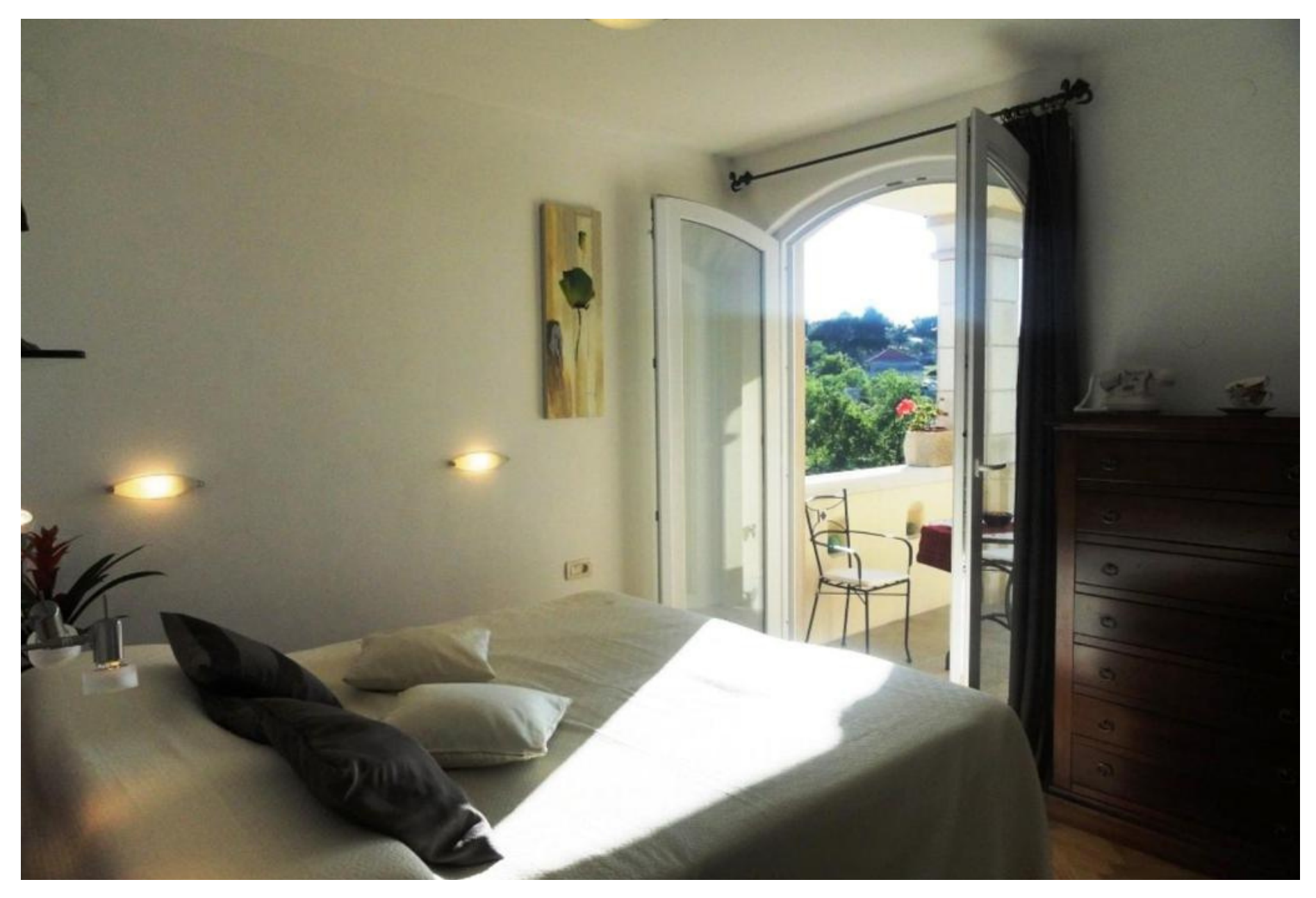
Wake up to sunlight and fresh air in this cozy, bright bedroom with direct access to acharming balcony.