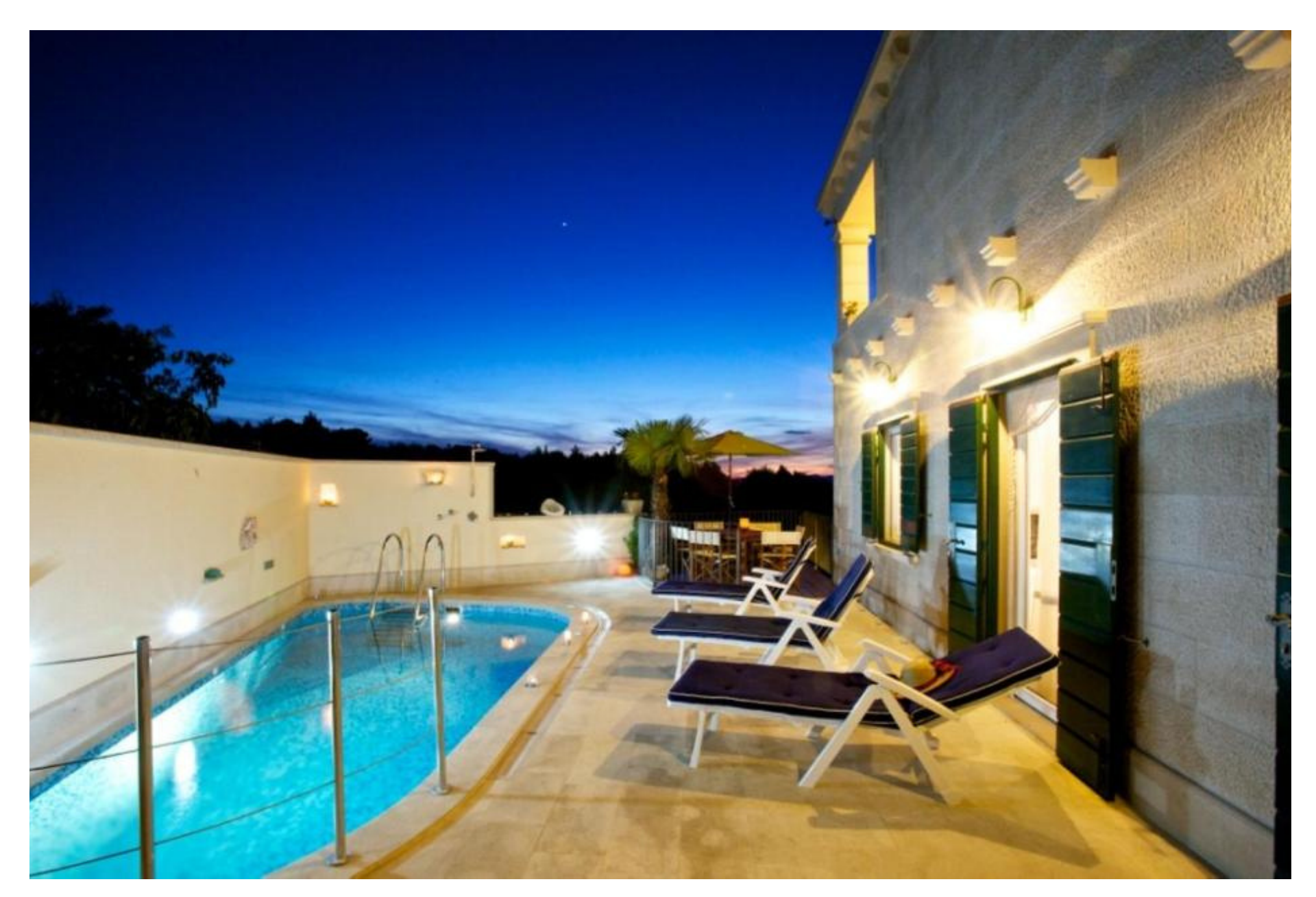
Unwind by the private pool under the stars, where comfort meets Mediterranean elegance.

Villa Serena is a charming Mediterranean getaway nestled in the peaceful village of Mirca on the island of Brač, just 900 meters from the sea. Surrounded by nature and tranquility, this spacious villa features four bedrooms, three bathrooms, a sauna, an outdoor pool, and multiple terraces perfect for enjoying the Dalmatian sun. Designed for comfort and relaxation, the villa offers a warm, homely atmosphere ideal for families or groups looking for a serene retreat. With two fully equipped kitchens and living areas, Villa Serena provides both flexibility and privacy in a naturally beautiful setting.