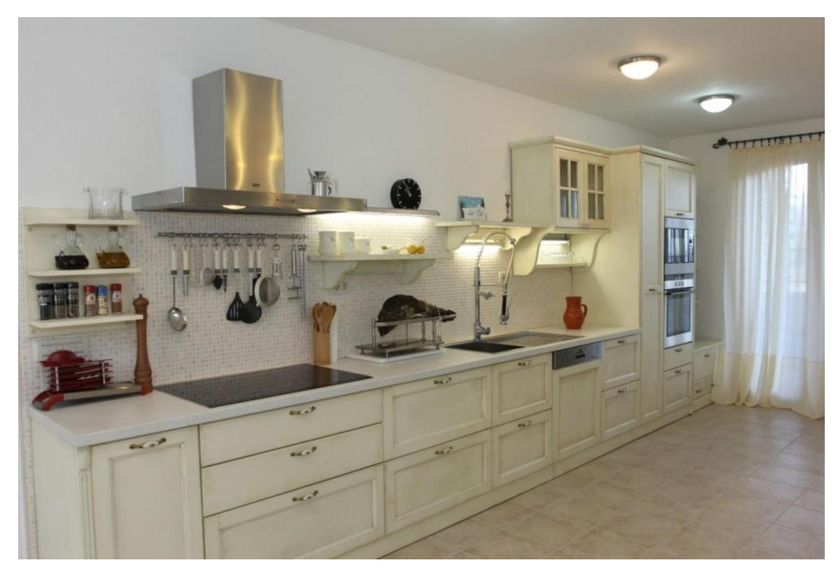
Cook or dine out, plenty of choices