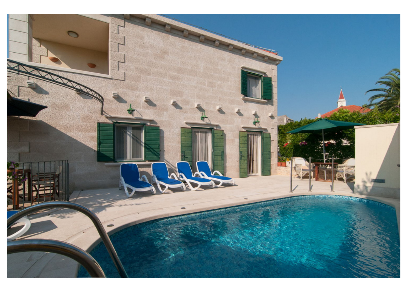
South terrace for relaxing